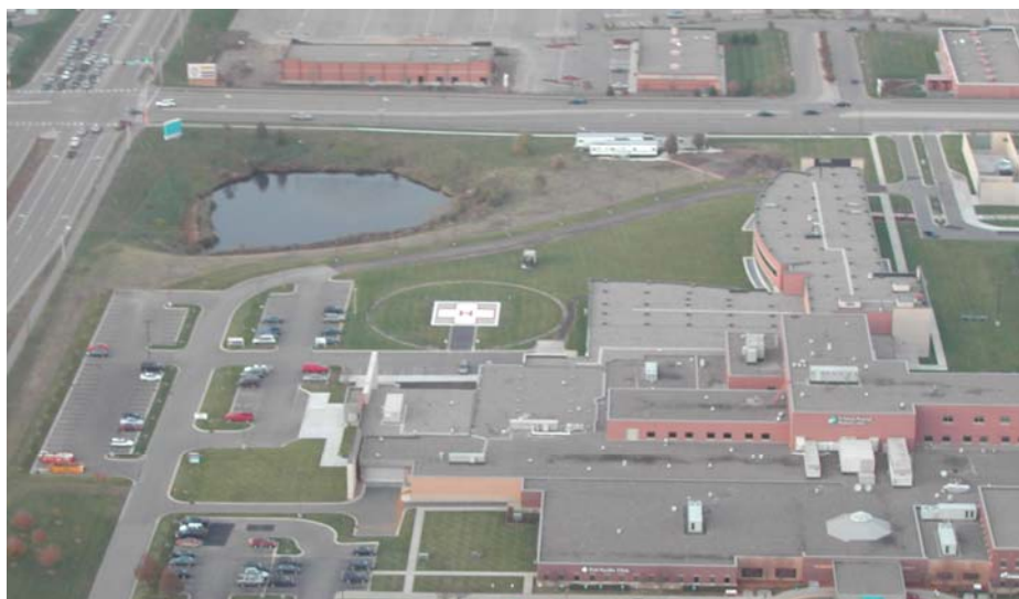
Shakopee, MN St. Francis Regional Medical Center ( ) N 44° 46.34' W 93° 30.24' IMPORTANT: The pilot retains full responsibility for safe and legal flight operations, regardless of data presented on this page.