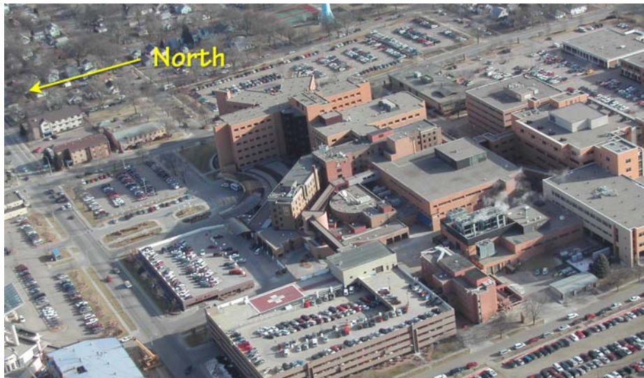
Sioux Falls, SD Sioux Valley Hospital (1SD9) N 43°32.3' W 96°44.6' IMPORTANT: The pilot retains full responsibility for safe and legal flight operations, regardless of data presented on this page.

6' chainlink fence on North side of pad. Approach East or West.