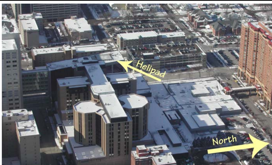
Rochester, MN Rochester Methodist Hospital (MN56) N 44° 01.45' W 92° 28.02' IMPORTANT: The pilot retains full responsibility for safe and legal flight operations, regardless of data presented on this page.

Rooftop pad, NW corner of hospital. Mechanical equipment surrounding pad. Building 1/4 mile N.