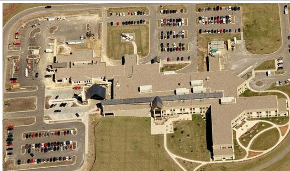
Northfield, MN Northfield Hospital ( ) N 44°28.45' W 93° 11.52' IMPORTANT: The pilot retains full responsibility for safe and legal flight operations, regardless of data presented on this page.