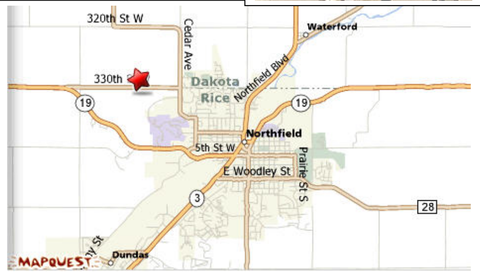
Northfield, MN Northfield Hospital ( ) N 44°28.45' W 93° 11.52' IMPORTANT: The pilot retains full responsibility for safe and legal flight operations, regardless of data presented on this page.