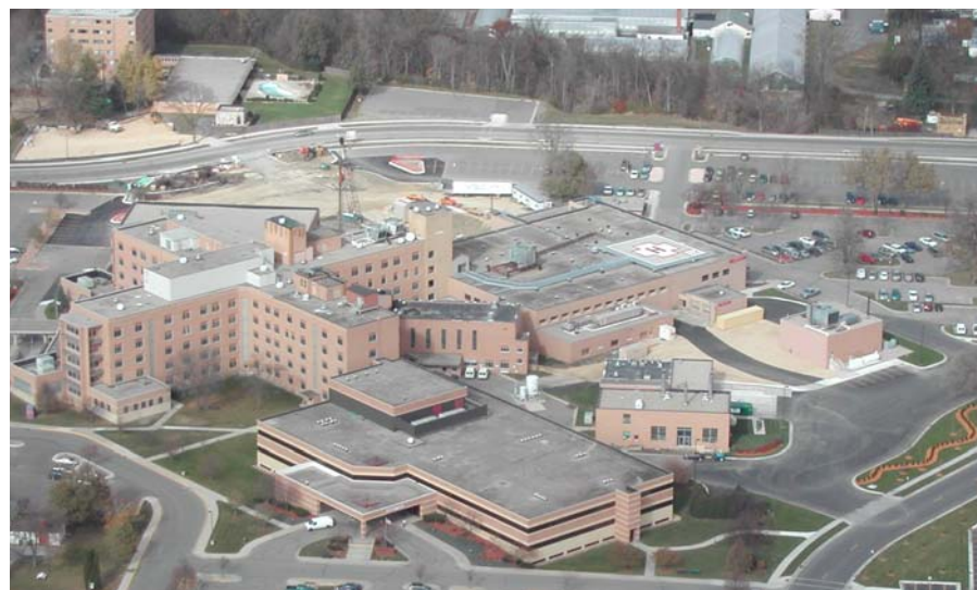
Mankato, MN Immanuel St. Joseph's (3MN6) N 44° 09.85 W 93°59.01 IMPORTANT: The pilot retains full responsibility for safe and legal flight operations, regardless of data presented on this page.

Rooftop pad NE side of hospital. Cell towers 1/2 mile W of hospital.