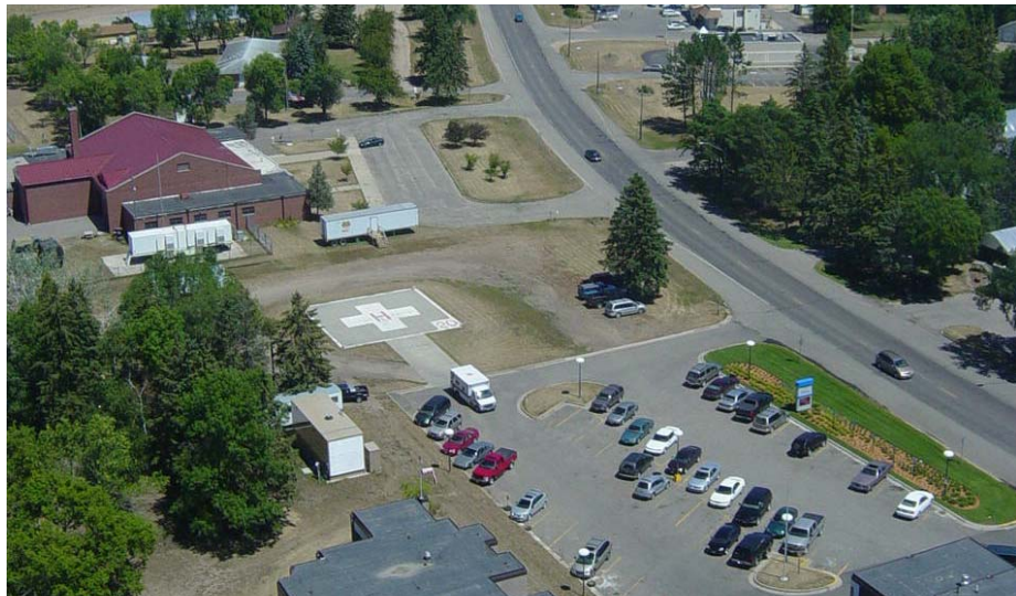
Wadena, MN Tri-County Hospital ( )

IMPORTANT: The pilot retains full responsibility for safe and legal flight operations, regardless of data presented on this page.