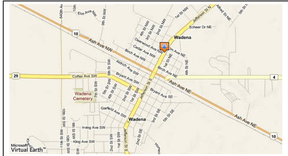
Wadena, MN Tri-County Hospital ( )

IMPORTANT: The pilot retains full responsibility for safe and legal flight operations, regardless of data presented on this page.