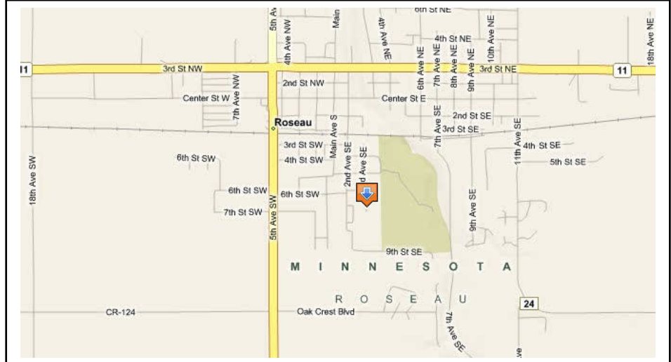
Roseau, MN Roseau Area Hospital ( )

IMPORTANT: The pilot retains full responsibility for safe and legal flight operations, regardless of data presented on this page.