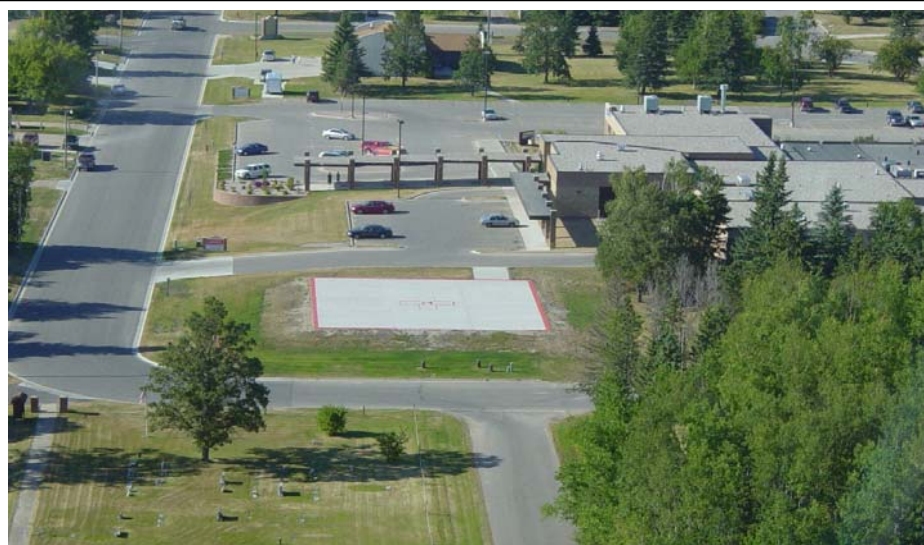
Roseau, MN Roseau Area Hospital ( )

IMPORTANT: The pilot retains full responsibility for safe and legal flight operations, regardless of data presented on this page.