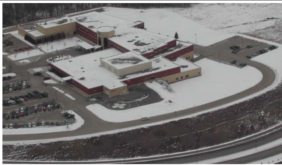
Red Wing, MN Fairview Redwing Medical Center (97MN) N 44°33.56 W 92°34.38

Watertower 1/4 mile SW of pad. Parking lot lights W of pad. Remain below 2200'MSL when KRGK conducting IFR ops