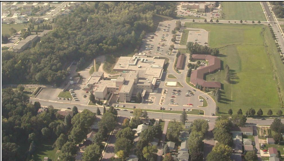
New Ulm, MN New Ulm Medical Center (MY84) N 44° 18.82' W 94° 28.56' IMPORTANT: The pilot retains full responsibility for safe and legal flight operations, regardless of data presented on this page.