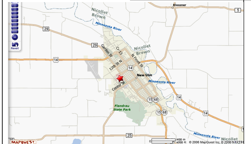
New Ulm, MN New Ulm Medical Center (MY84) N 44° 18.82' W 94° 28.56' IMPORTANT: The pilot retains full responsibility for safe and legal flight operations, regardless of data presented on this page.