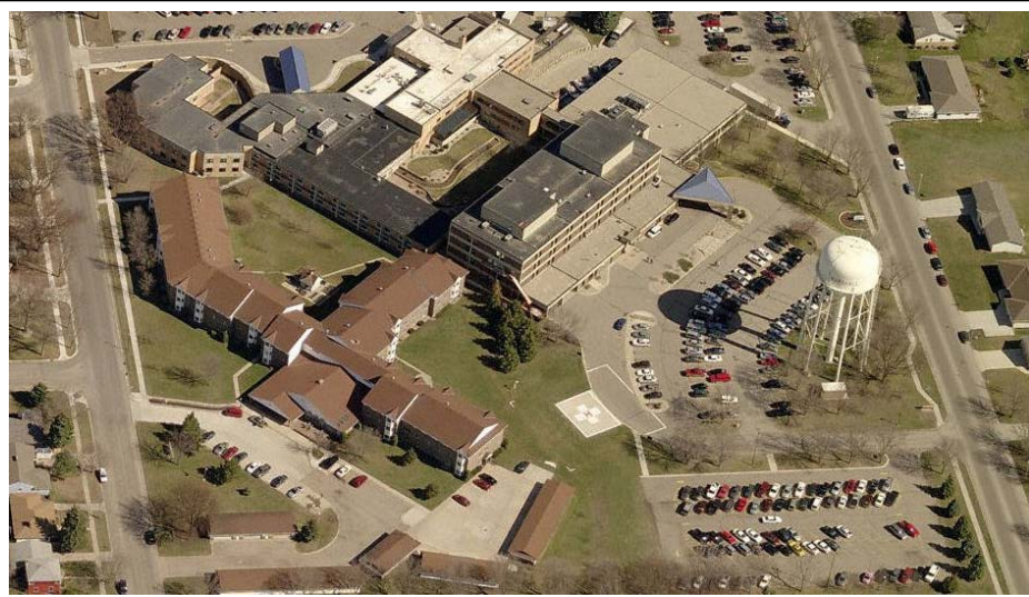
Marshall, MN Avera Marshall Regional Medical Center ( ) N 44° 26.8' W 95° 46.7' IMPORTANT: The pilot retains full responsibility for safe and legal flight operations, regardless of data presented on this page.