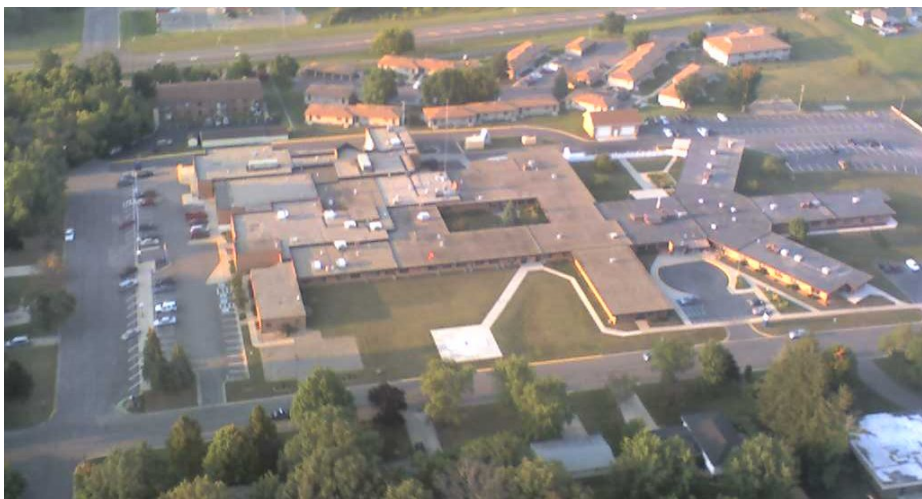
Long Prairie, MN Long Prairie Memorial Hospital ( ) N 45° 58.4' W 94° 50.9' IMPORTANT: The pilot retains full responsibility for safe and legal flight operations, regardless of data presented on this page.