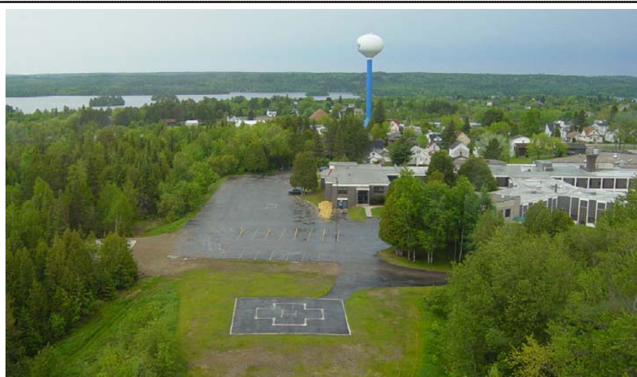
Ely, MN DC-Ely (0MN7) N 47° 53.95' W 91° 52.38' IMPORTANT: The pilot retains full responsibility for safe and legal flight operations, regardless of data presented on this page.