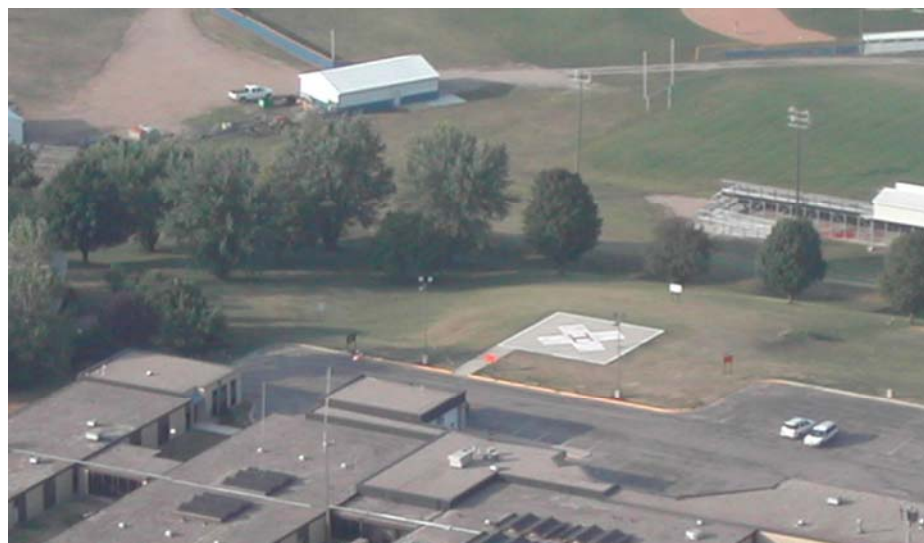
Jackson, MN Jackson Medical Center Hospital (1MN9) N 43°37.49' W 95°00.23' IMPORTANT: The pilot retains full responsibility for safe and legal flight operations, regardless of data presented on this page.