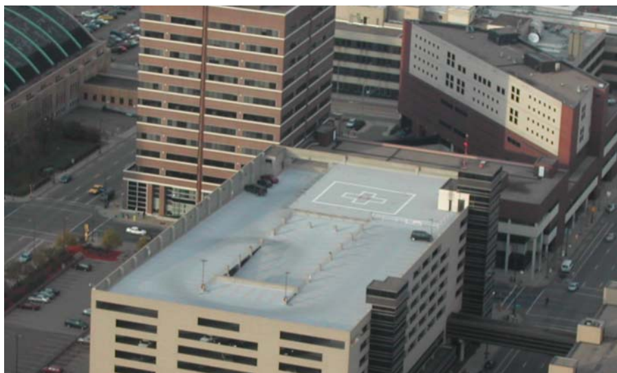
Minneapolis, MN Hennepin County Medical Ctr ( )

IMPORTANT: The pilot retains full responsibility for safe and legal flight operations, regardless of data presented on this page.