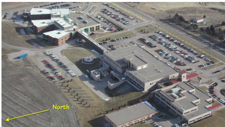
Sioux Falls, SD Avera- Heart Hospital (2SD6) N 43°29.5' W 96°46.8' IMPORTANT: The pilot retains full responsibility for safe and legal flight operations, regardless of data presented on this page.