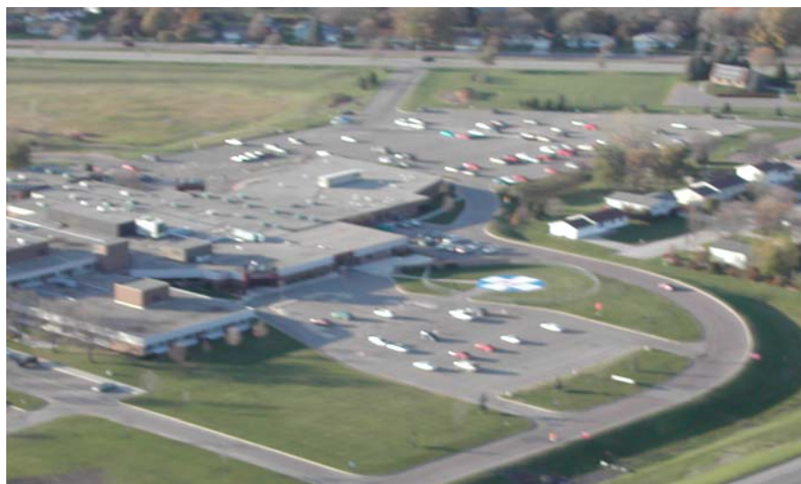
Fairmont, MN Fairmont Medical Center ( ) N 43° 38.38 W 94° 26.95 IMPORTANT: The pilot retains full responsibility for safe and legal flight operations, regardless of data presented on this page.

4' chain link fence around helipad. Lighted windsock 100' E of helipad. Watertower 1/2 mile N of hospital.