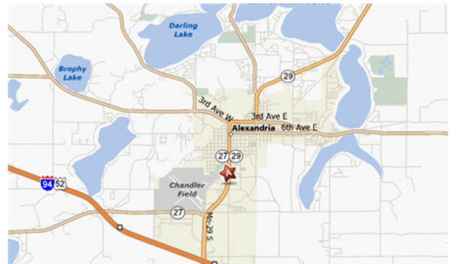
Alexandria, MN Douglas County Hospital (MY91) N 45°52.41' W 95°22.64' IMPORTANT: The pilot retains full responsibility for safe and legal flight operations, regardless of data presented on this page.