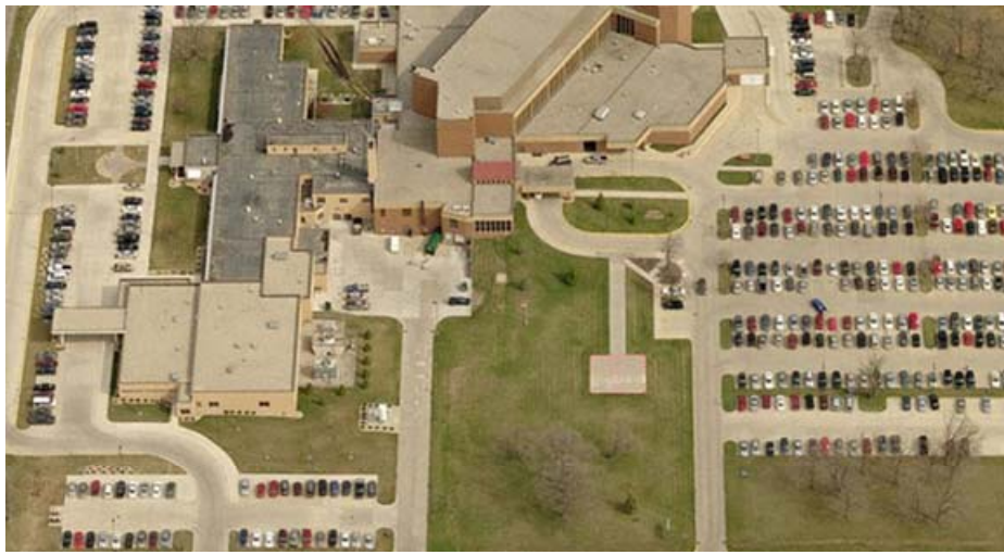
Alexandria, MN Douglas County Hospital (MY91) N 45°52.41' W 95°22.64' IMPORTANT: The pilot retains full responsibility for safe and legal flight operations, regardless of data presented on this page.